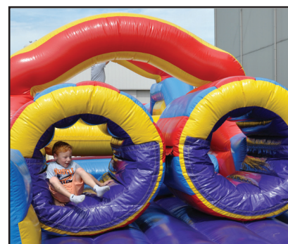
Capt. Rachel Ingram

Reserve Citizen Airmen from the 445th Airlift Wing, families and friends enjoyed a day of food and fun at the wing's annual family day picnic, Sept. 10, 2022 at hangar 4016. Participants enjoyed corn hole, children's bouncy houses, remote control vehicles, face painting and other activities. A C-17 Globemaster III static display was available for tours and a DJ was on hand for entertainment. In addition, various helping agencies provided useful information to Airmen and their families. Food and activities for the event were provided by the Wright-Patterson Air Force Base United Service Organizations (USO) and the Miami Valley Military Affairs Association (MVMAA).